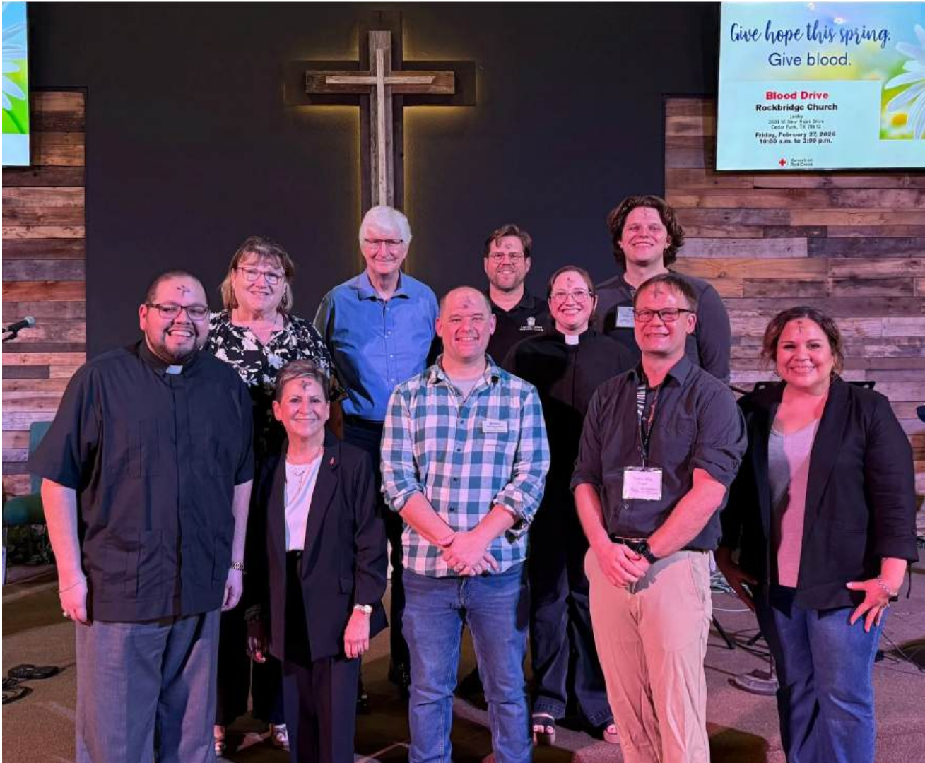
Joint Ash Wednesday Service Article