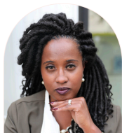
Keynote Speaker: Kimberly Holiday Mayor Pro Tem Pflugerville City Council Place 3