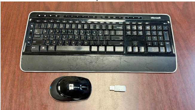
Microsoft Wireless Desktop 3000 v2.0, $16 (2 available)

Monitor includes both a power cable and a video cable.