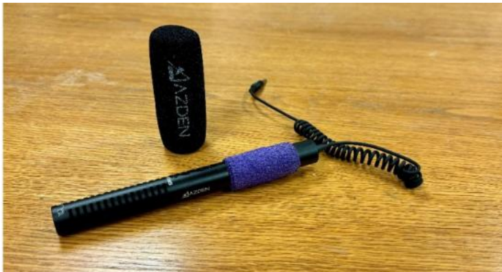
Azden SMX-10 Stereo Microphone - $20