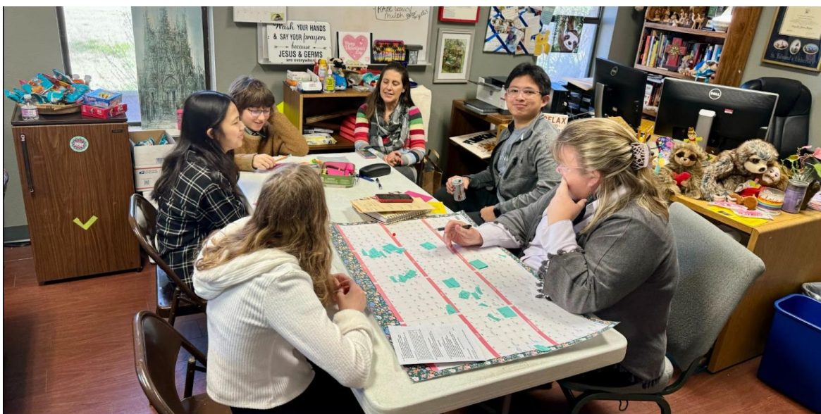
Youth Sunday School