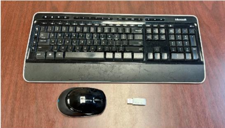
Microsoft Wireless Desktop 3000 v2.0, $16 (2 available)

The church has a number of surplus equipment items for sale. Click on the link under the pictures for more detailed information. Church friends and members get a discount off the listed price.