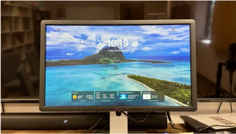
Dell 23" UltraSharp FHD Monitor, model U2312HMT - $45 Monitor includes both a power cable and a video cable.

The church has a number of surplus equipment items for sale. Click on the link under the pictures for more detailed information. Church friends and members get a discount off the listed price.