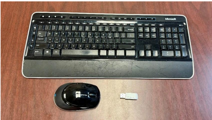
Microsoft Wireless Desktop 3000 v2.0, $18