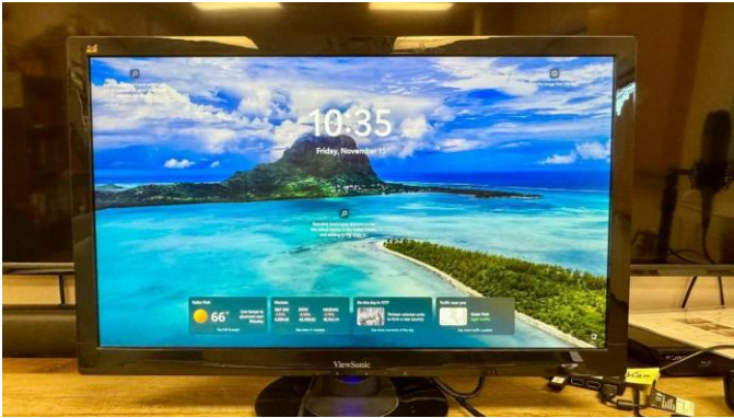
ViewSonic 24" FHD Monitor, model VA2446mh w/Speakers - $55

The church has a number of surplus equipment items for sale. Click on the link under the pictures for more detailed information. Church friends and members get a discount off the listed price.