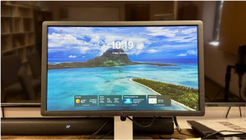
Dell 23" UltraSharp FHD Monitor, model U2312HMT - $45

The church has a number of surplus equipment items for sale. Click on the link under the pictures for more detailed information. Church friends and members get a discount off the listed price.