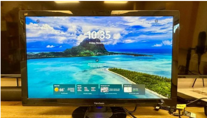
ViewSonic 24" FHD Monitor, model VA2446mh w/Speakers - $55

The church has a number of surplus equipment items for sale. Click on the link under the pictures for more detailed information. Church friends and members get a discount off the listed price.