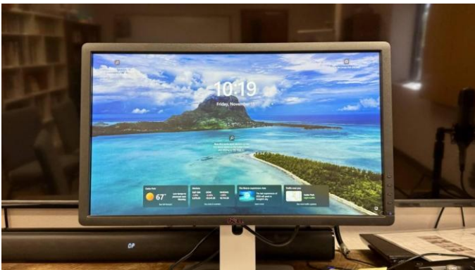
Dell 23" UltraSharp FHD Monitor, model U2312HMT - $45

Monitors include both a power cable and a video cable.