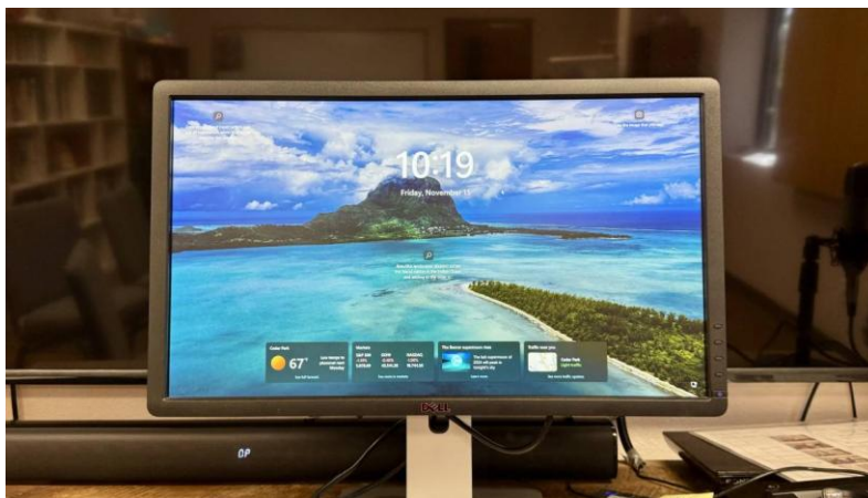
Dell 23" UltraSharp FHD Monitor, model U2312HMT - $45

Both monitors include a power cable and a video cable. Contact Neil Howard. nhowardtx1@gmail.com if you are interested in any of these surplus equipment items.