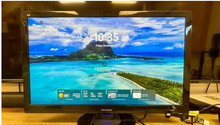
ViewSonic 24" FHD Monitor, model VA2446mh w/Speakers - $55

The church has a number of surplus equipment items for sale. Click on the link under the pictures for more detailed information. Church friends and members get a discount off the listed price