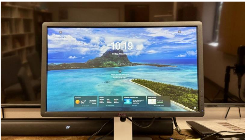
Dell 23" FHD Monitor, model U2312HMt - $45