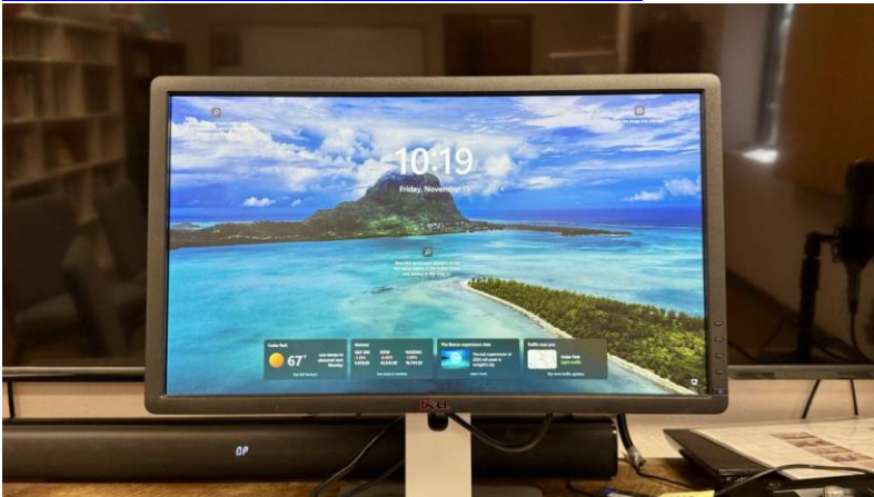
Dell 23" FHD Monitor, model U2312HMT - $45