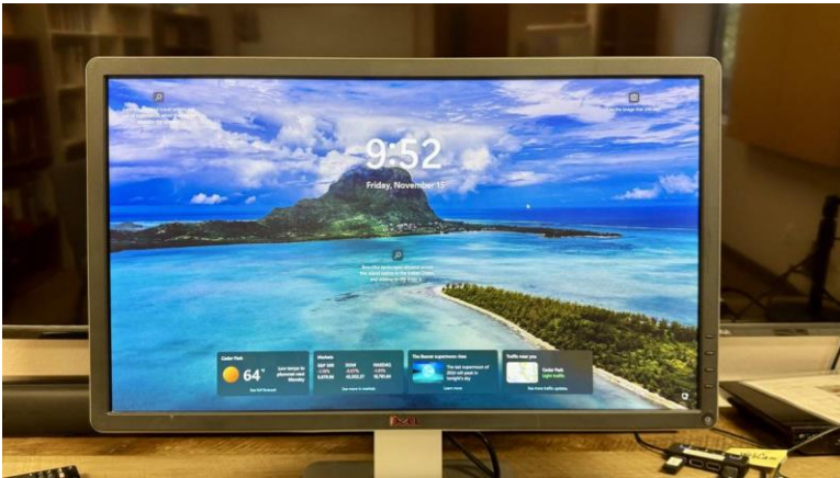
Dell 24" FHD Monitor, model P2414Hb - $40