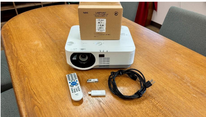
NEC P452H Full HD Projector with NEC WiFi Adapter - $355

The church has a number of surplus equipment items for sale. Click on the link under the pictures for more detailed information. Church friends and members get a discount off the listed price.