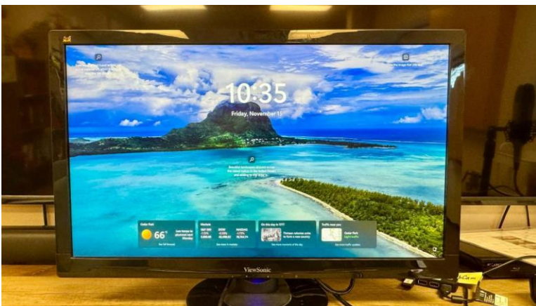
ViewSonic 24" FHD Monitor, model VA2446mh w/Speakers - $55