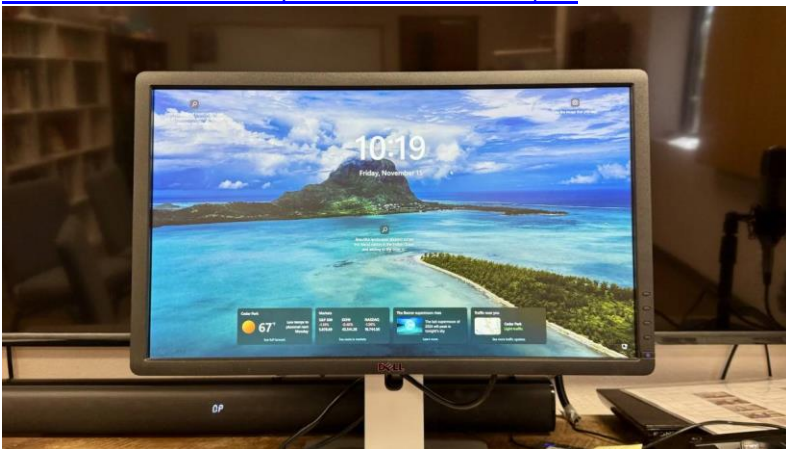
Dell 23" FHD Monitor, model U2312HMT - $45