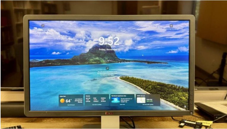
Dell 24" FHD Monitor, model P2414Hb - $40