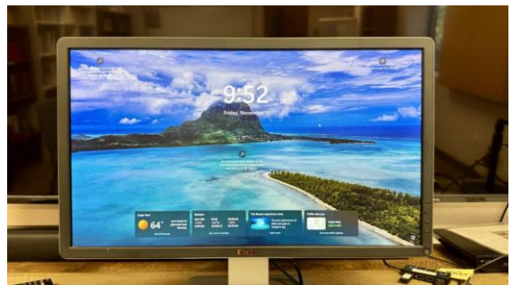
Dell 24" FHD Monitor, model P2414Hb - $45