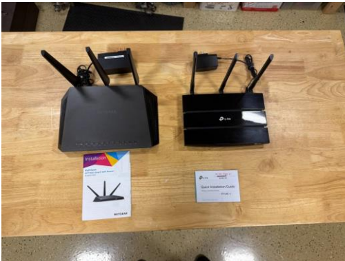
BOGO: Netgear Nighthawk R7000 PLUS TP-Link AC1750 WiFi 5 Routers - $25

The church has a number of surplus equipment items for sale. Click on the link under the pictures for more detailed information. Church friends and members get a discount off the listed price.