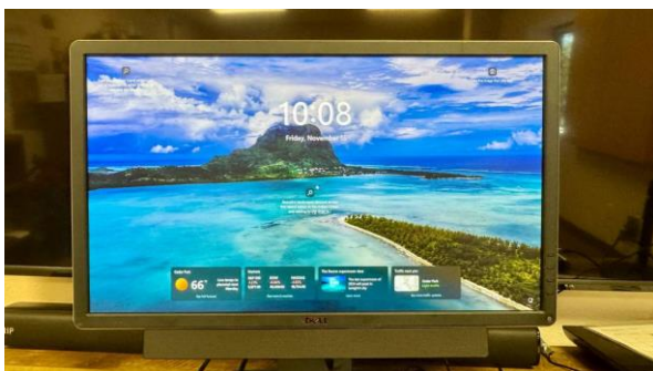
Dell 24" FHD Monitor, model P2414Hb with Dell Sound Bar - $55