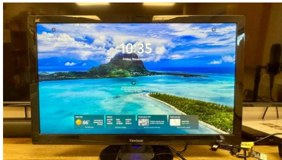
ViewSonic 24" FHD Monitor, model VA2446mh w/Spkrs - $60