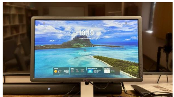
Dell 23" FHD Monitor, model U2312HMT - $50