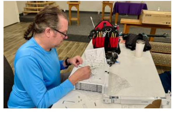
PROJECTOR continued on p. 6

Our new Epson PowerLite model L260F front-facing projector was installed on March 7 by ACA Electronics Inc. (Chris and Dana Ross), a local, Cedar Park small business. The new Epson is a 1080p (1920x1080) resolution, 16:9 aspect ratio, 3LCD model producing 4600 lumens of brightness, slightly more than the old NEC P452H's 4500 lumens. The new projector has a solid-state, 88-watt laser diode for illumination which should last 20,000