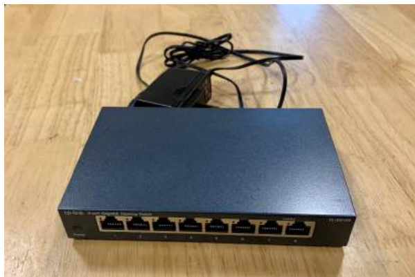
TP-Link 8-Port Gigabit Switch model TL-SG108, $10