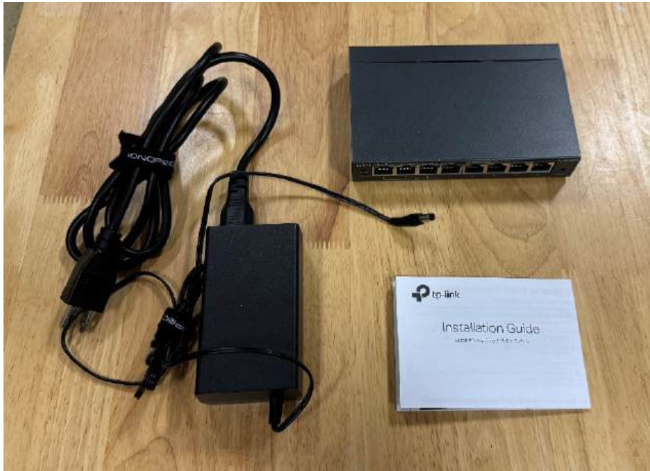
TP-Link 8-Port Gigabit, 4-Port PoE Switch model TL-SG108PE, $25

Contact Neil Howard. nhowardtx1@gmail.com if you are interested in any of these surplus equipment items.