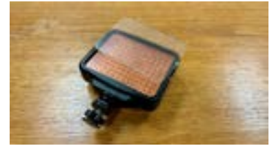
Bower VL15K 120-Bulb LED Video Light , $22