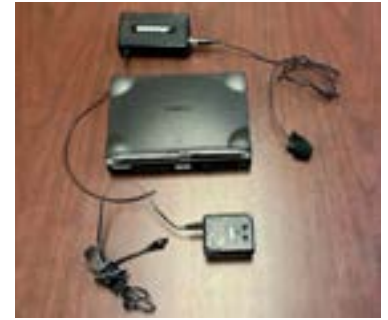
Shure Wireless Lavalier Microphone System , $55