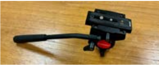
Newer Video Tripod Fluid Head with Quick-Release Plate/Detachable Handle , $25