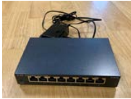
TP-Link 8-Port Gigabit Switch model TL-SG108 , $10