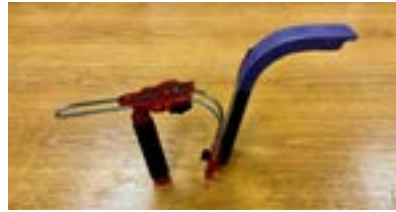
Opteka CXS-1 Should Stabilizer for Camera , $25