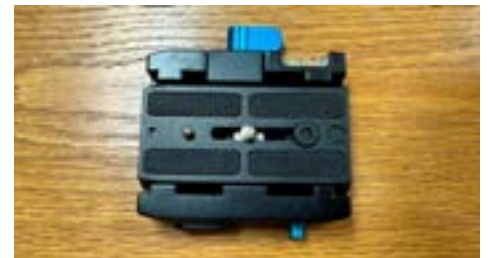
Quick-Release Base Plate Compatible with Manfrotto 500AH/501 , $5