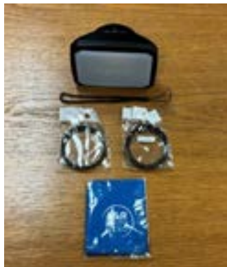
Mennon DVs-16:9 Lens Hood , $5