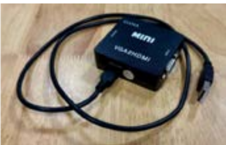
GANA VGA to HDMI Converter , $5 (Two units available)