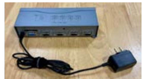
DTECH DT-7504 1 x 4 VGA Splitter , $12