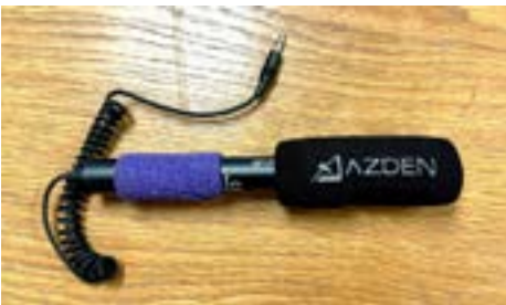
Azden SMX-10 Stereo Microphone , $20