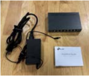
TP-Link 8-Port Gigabit, 4-Port PoE Switch model TL-SG108PE , $25

The church has a number of surplus equipment items for sale. Click on the link under the pictures for more detailed information. Church friends and members get a discount off the listed price. Contact Neil Howard at: nhowardtx1@gmail.com if you are interested in any of these surplus equipment items.