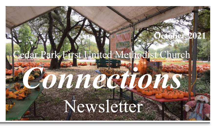
to Peace, and to Service