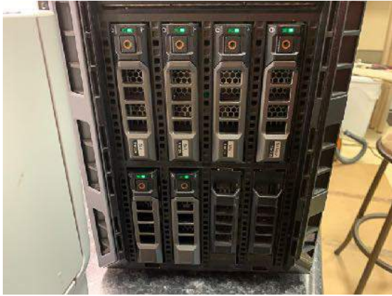
Figure 1 CPFUMC Electronic Archive Server

We recently upgraded the storage capacity of the server to 3.8TB by adding two more disks to the server's RAID5 array. The backup device capacity is 4TB. Right now, only about 34% of the total