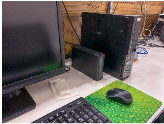
Figure 2 Backup Device in Sound Booth

capacity is full, so we have plenty of room to grow. The server was originally donated to the church in 2018. The additional disks just added were also donated. The backup device was purchased by the Trustees in 2020 for $150.