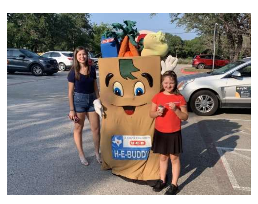
H-E-Buddy met all our members and guest.