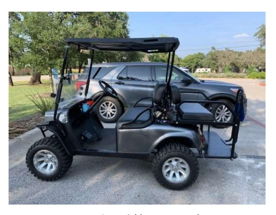
Our neighbors came and