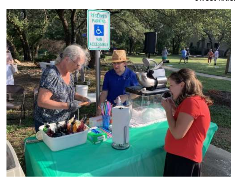
The Snow Cones were a perfect treat for a hot day.