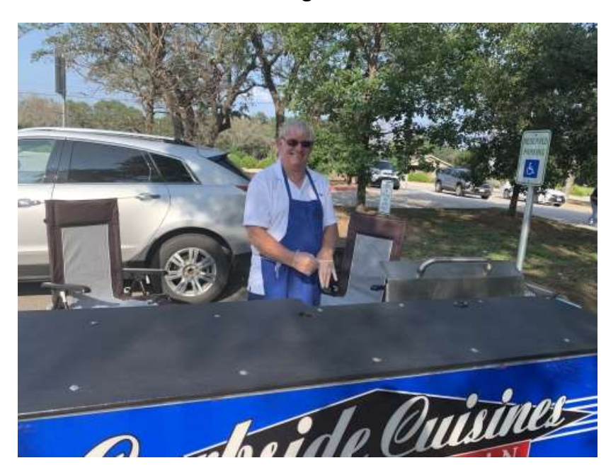
The hot dogs were fantastic.