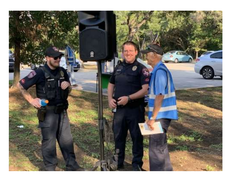
There were several Natinal Night Out organizers and police officers on site.