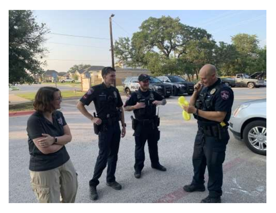
The police also brought the balloon animals.