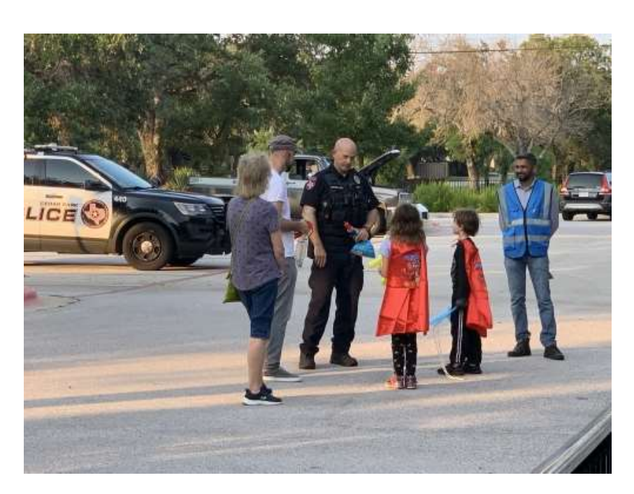
The police also greeted our guest.