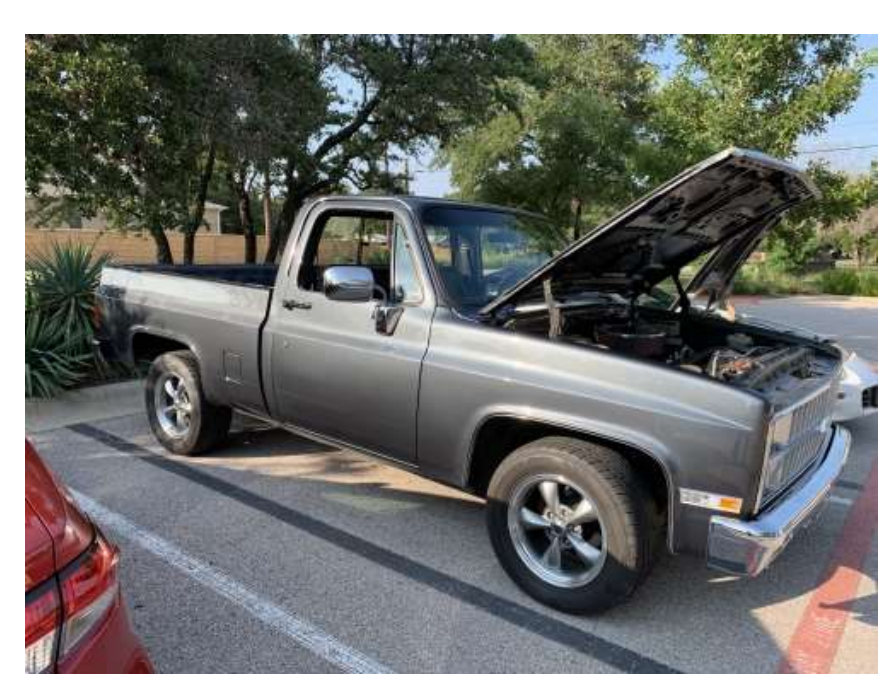
Sweet Rides of Central Texas