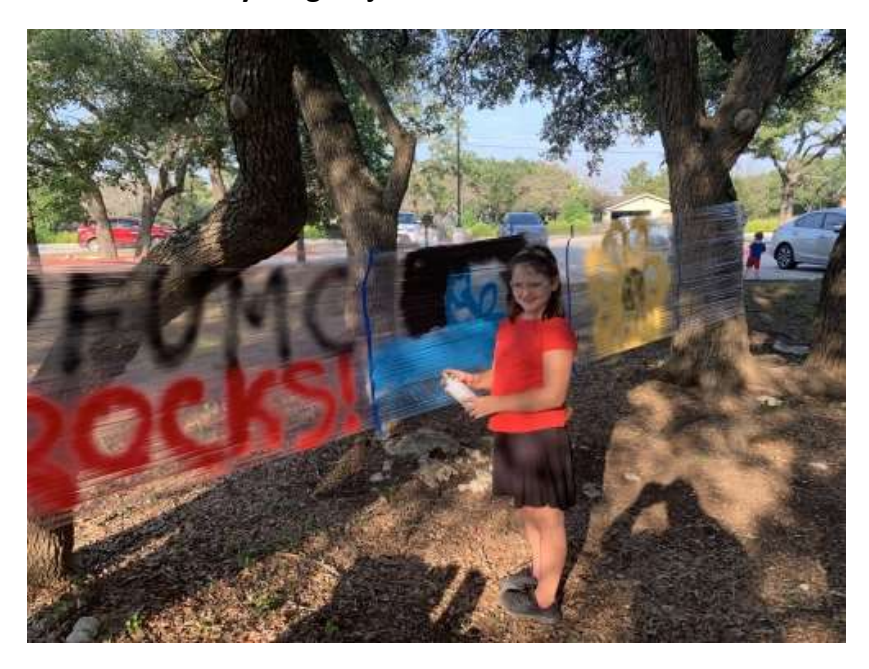
Did you get a chance to see the Graffiti wall?