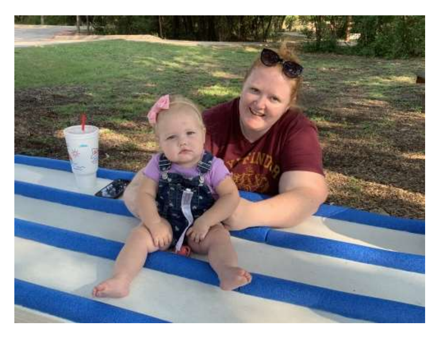
Our youngest joined in all the fun.