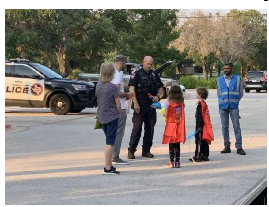
The neighborhood families came out in costume.