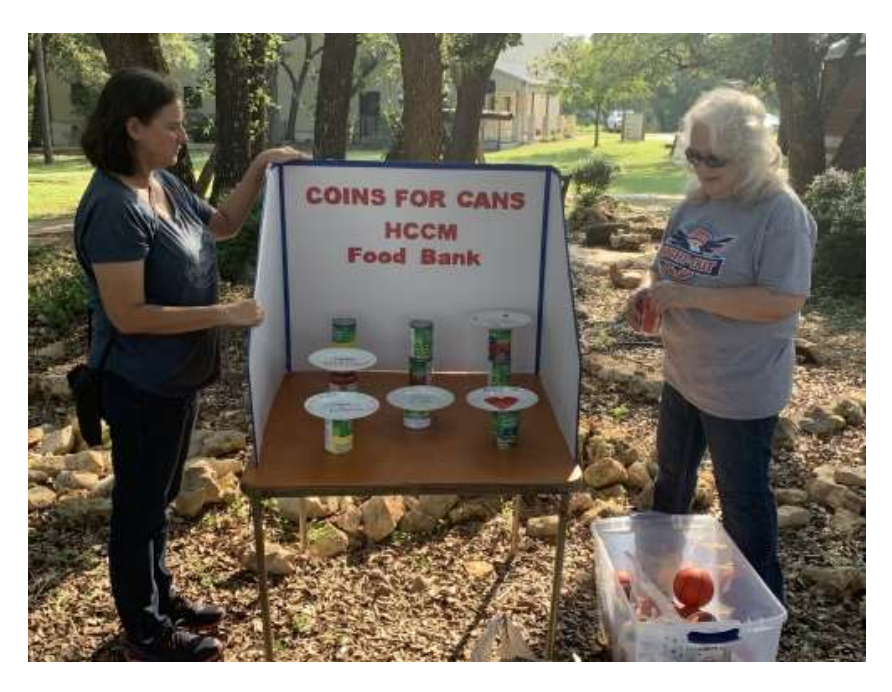
Coins and cans for HCCM.