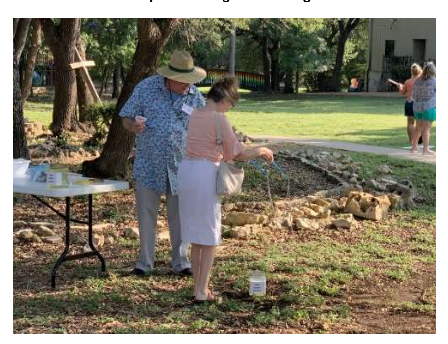
There were bubbles to make.