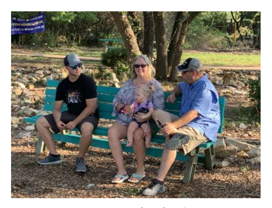
Some of our friends.