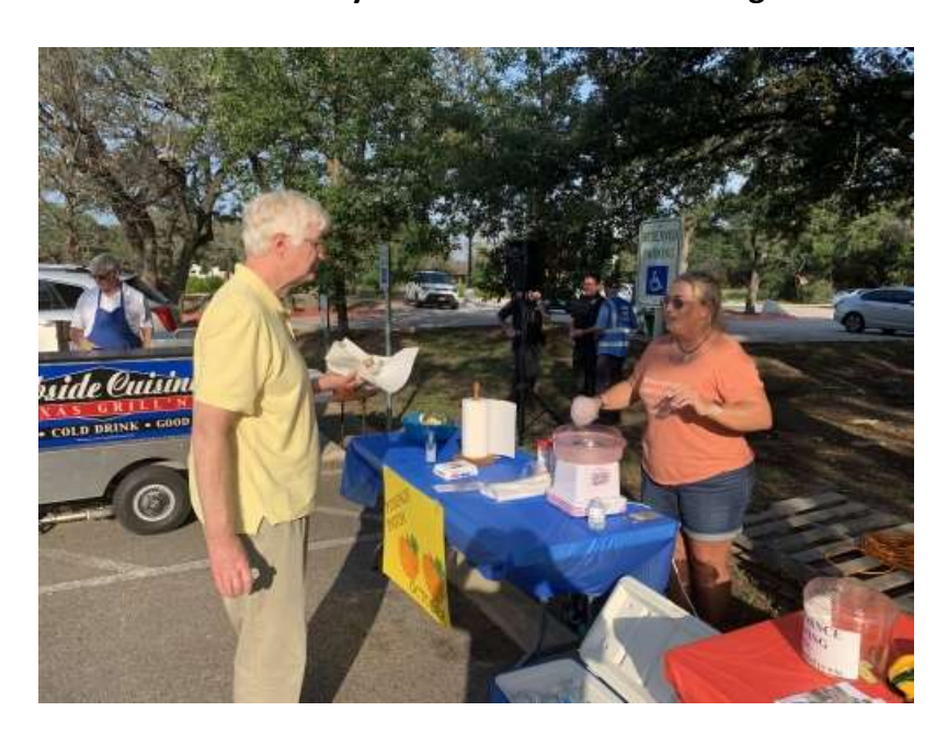
The event was not complete without a cotton candy.