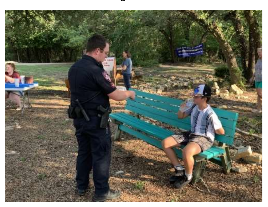
It was great to visit with our police officers.