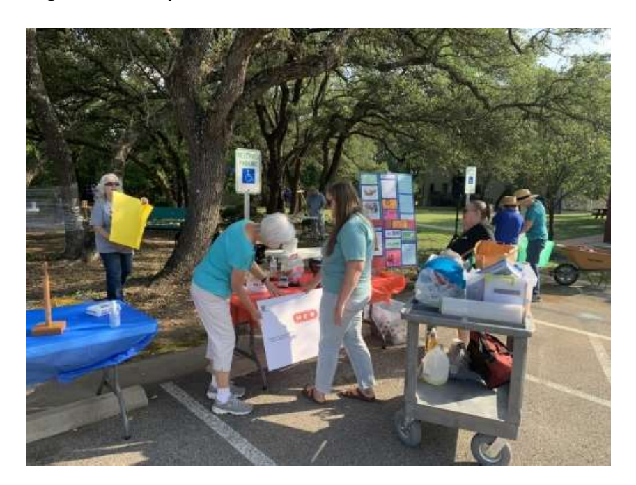
Nothing is complete until the clean-up is over.