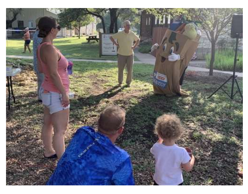
brought the children.