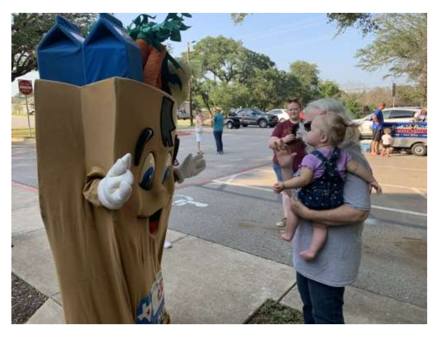
H-E-Buddy the littlest to the oldest.