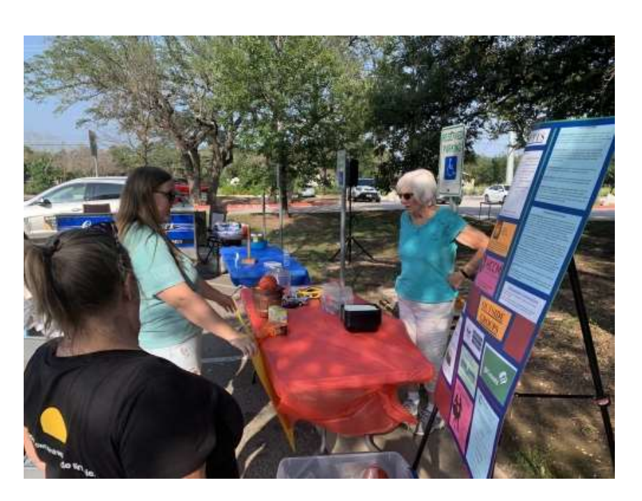
We welcomed our guest, shared our ministries, and gave out raffle tickets.