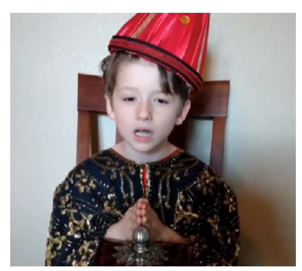
The Wisemen (James) followed the star to bring gifts to the King of Kings.