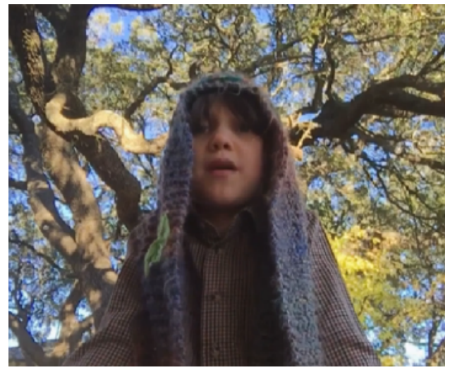
The Innkeeper (Leland), if he had only known this was the Son of God.