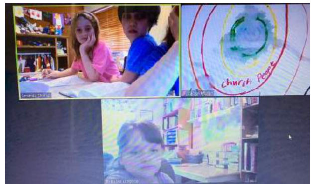
We now see that keeping God in the center of our life spreads to all areas of our life.