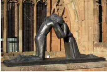
Reconciliation by Vasconcellos

PLEASE find ALL of the church announcements and happenings on the website: https://cpfumc.org