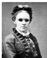
Fanny Cosby, Hymn