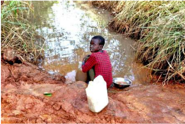
Boy Fetching Water.

and Uganda. The United Methodist Committee on Relief (UMCOR) is also targeting general famine conditions in Somalia and Ethiopia. One grant will provide food vouchers to 4,000 families in Somalia, while the other will provide 6,000 persons with clean water in drought-affected areas of Ethiopia. The total amount of the two grants is $173,088.