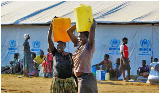
Women Carrying Water.

The United Methodist General Board of Global Ministries, through its disaster relief and global health units, is attempting to alleviate some of the suffering in cooperation with regional partner agencies. UNICEF (the United Nations International Children's Emergency Fund) reported in early March that an estimated 100,000 South Sudanese are starving and 1 million people face starvation. The World Health Organization (WHO) indicates that 4.7 million South Sudanese are in need of health services.