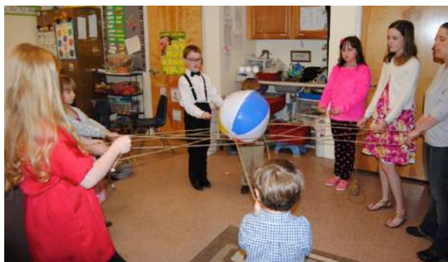
Our Valentine's party had several games.

Our classes had an exciting month. We look forward to our studies, learning more of how to glorify God.