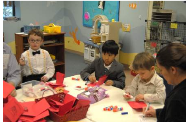
The boys also joined into the creativity.