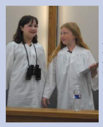
Being a mother is hard work as these two angels told us about in their skit during Children's Moment.