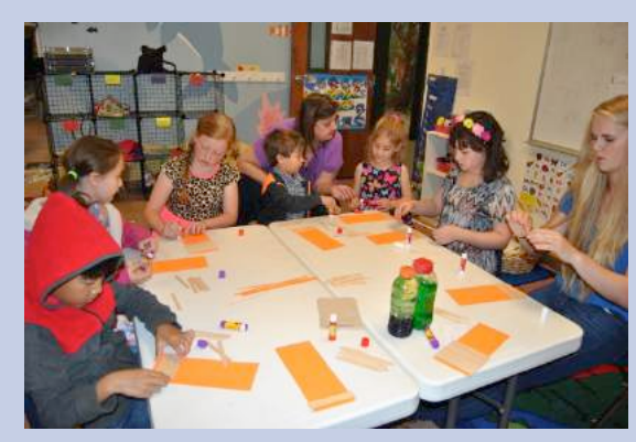
They started out with craft sticks and glue.

May has been a special month for the Jesus Rock Stars. In discussing the many events which happen in May the children shared their stories about how much their mothers do for them. In sharing these stories they were reminded of the things all ladies of our church also do for them. The children wanted to prepare a special gift for all the ladies which were handed out during Children's moment on Mother 's Day.