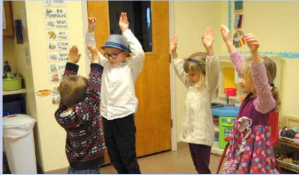
But when we hear God's words we grow full and tall.

The Jesus Rock Stars have been discussing Lent. We have shared with each other how we talk to God. Our younger class has been studying parables and how they encourage us to talk with and listen to God through out our daily lives.